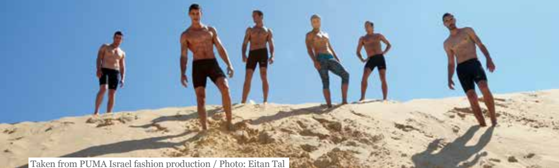
Taken from PUMA Israel fashion production / Photo: Eitan Tal